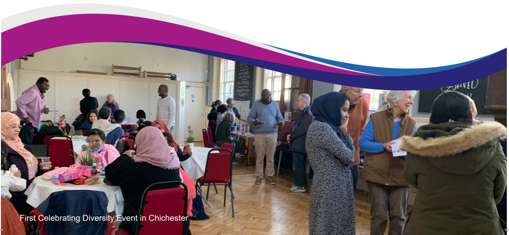
First Celebrating Diversity Event in Chichester