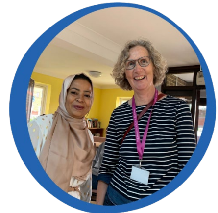
Celebrating Diversity event in Littlehampton

Our aim is to share the findings on key themes from the conversations completed so far. Suggested ideas have been made to help increase meaningful engagement to address some of the issues and concerns raised.