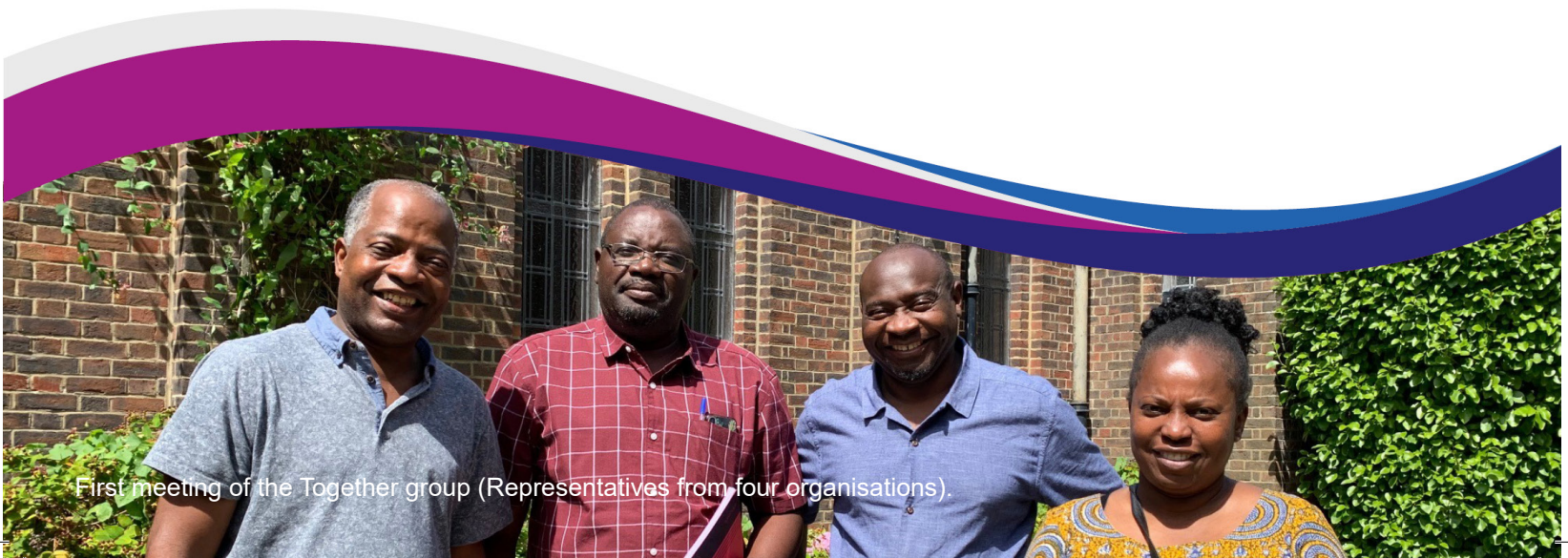
First meeting of the Together group (Representatives from four organisations).

Information was captured through conversations (face to face, virtually and by telephone) with organisations led by people from ethnically diverse backgrounds, local faith leaders and people living within the community, statutory services and organisations who actively engage with ethnically diverse communities in Arun and Chichester.