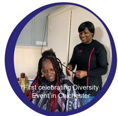
First celebrating Diversity Event in Chichester

Through this project we have looked holistically at ethnically diverse communities' experience of living and working in Arun and Chichester.