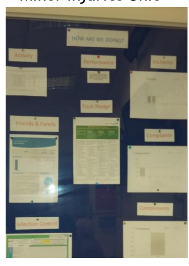
Minor Injuries Unit

This photo was taken in an area that did not have a clinic on. There was a completed board in the area where the clinics were running.